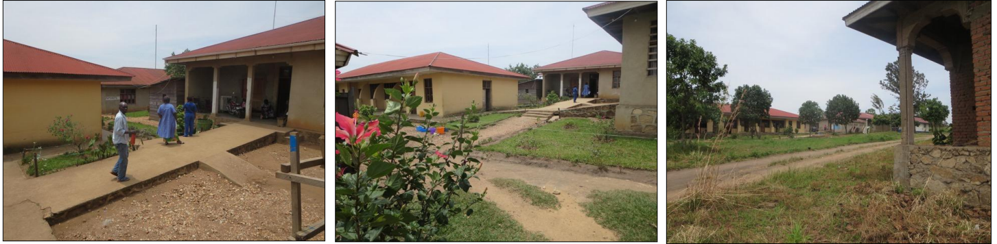
Above: Bunia hospital – has about 90 beds and cared for over 4,000 hospitalized patients last year.