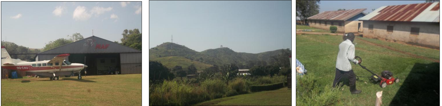
Above: Nyankunde – left: MAF are back!; Centre: The view from the runway; Right: 'modern' mowers behind the operating theatre & maternity and the 120-bed hospital where over 8,000 patients were treated last year.