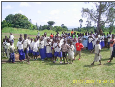
Students in their uniforms (mostly!)