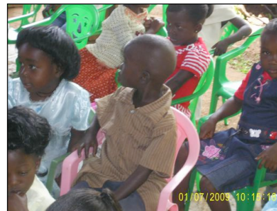
Nursery School class