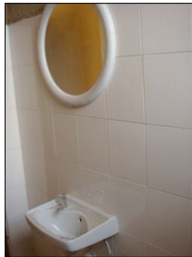
Operating Theatre bathrooms