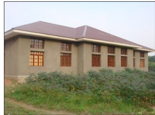
Intensive Care Unit Building