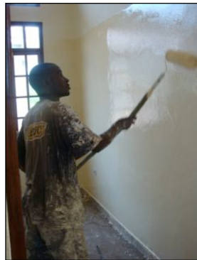
Operating Theatre painting